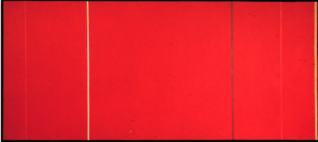
Fig 1. Barnett Newman Vir Heroicus Sublimis

Lyotard claims that at the heart of Newman's work lies the question is it happening? – the 'it' being an un-nameable matter or event, and the question filled with anxiety because it is possible that nothing is happening, perhaps there is only a void. When Vir Heroicus Sublimis was first exhibited at the Betty Parsons Gallery in New York, Newman tacked a notice to the wall which read, 'There is a tendency to look at large pictures from a distance. The large pictures in this exhibition are intended to be seen from a short distance.' The idea being that to be immersed in the enormous scale, something that up close is larger than our perception, gives a more forceful experience of the work. Lyotard suggests that just as in music the same note has a different timbre according to the instrument on which it is played, the same colour will be seen differently in different media – oil for example, or watercolour. 4