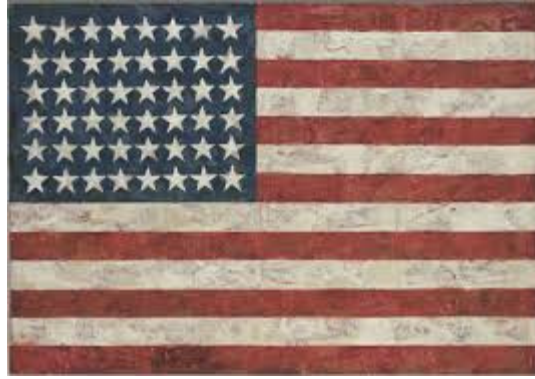
Figure 2. Jasper Johns, Flag

As one contemporary critic questioned, 'Is it a flag or a painting?' Johns' interest in the flag was, as he acknowledged, because he 'didn't have to design it' – by concentrating on things that 'the mind already knows' he was able to open up different subjects. And in the case of the Flag , this is explored by the juxtaposition of the associations of what is an iconic image, and the detail one can read in it when we get up close. Johns' technique used newspaper soaked in colour, which allows the print to be red in the white stripes. The time of this flag's making was at the start of the Cold War and in the middle of the McCarthy era which saw aggressive attacks and surveillance of many citizens, often mistakenly suspected of communist affiliation which was seen as anti-American.