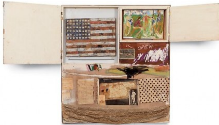
Figure 3. Short Circuit (Combine Painting)

Of course this kind of conceptual art had a history, from the irreverent doctoring at the hands of Marcel Duchamp and his 'readymade' defacement of a postcard of Leonardo's Mona Lisa , alongside one of Andy Warhol's silkscreen prints using a similar postcard with screen-print overlay, Mona Lisa , 1963, on the occasion of the loan of Leonardo da Vinci's work to the Metropolitan Museum of Art in New York. These works demand that we reconsider our expectations with regards to authenticity, making, and craft. Just what do we expect of art, and how highly do we prize the concept of originality? Moreover, what does it mean to speak of an original, in the face of technologies for mass-printing, now exploited by the artist? What are the icons of modern culture, and what do they tell us of our priorities? Barbara Kruger's work from the 1980s, such as the 1981 piece, Untitled (Your Gaze Hits The Side Of My Face) or 1987 I shop therefore I am (figure 4) subvert billboard advertising to comment on consumerism, celebrity culture, and power from a feminist perspective. But with appropriate postmodern irony, she releases her images (under careful management) for the very consumerist society that she questions: her work has been translated onto mugs, tee-shirts, umbrellas, bags. After all, is this not the most fruitful means of communicating the politically and ethically conscious postmodern?